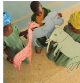
Walking on the beach or going to the zoo.