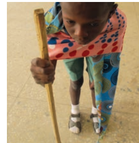
Father waiting at the gate.