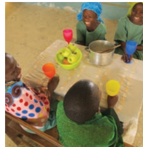
Staying with Lamide's family.